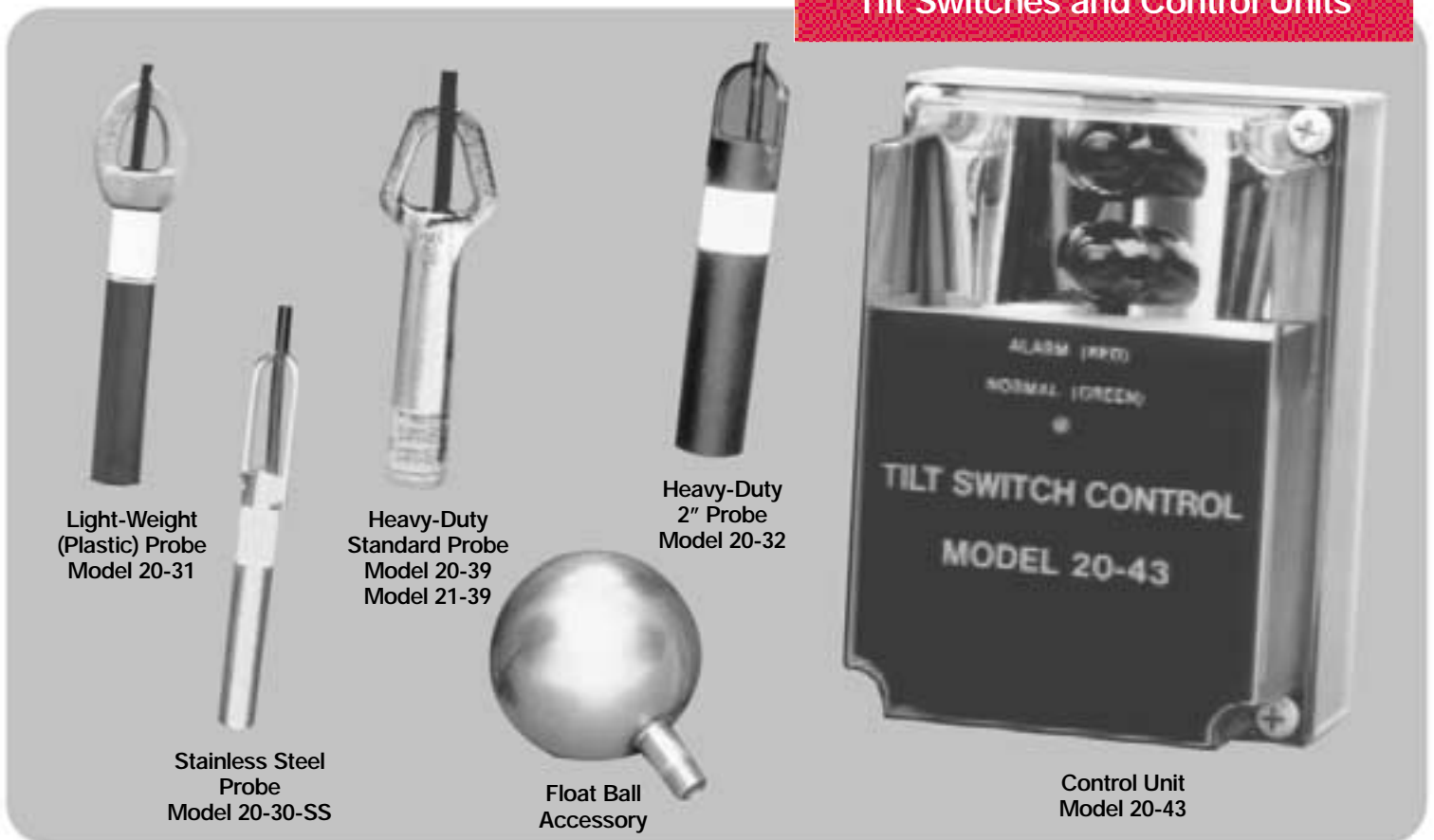
Light-Weight (Plastic) Probe Model 20-31